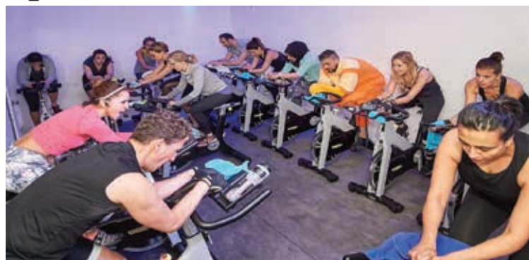
Wheely tough: Members of Spin Cyclub during their marathon session.

A 45-minute indoor cycling class is tough