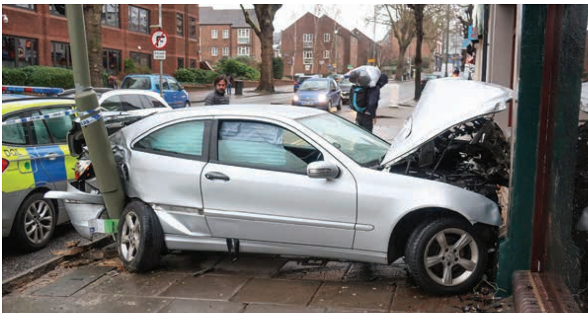
Wreckage: The aftermath of the multiple car accident on the High Road.