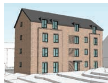
New block: How the flats will look from Norfolk Close, with the High Road behind.

The application to develop the site was featured in our regular planning applications list (page 2 of every issue) in the summer of 2017 and given permission by Barnet Council that same year.