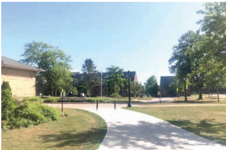
Campus: Mount Allison University in New Brunswick.

Finally, everyone in this university has been accommodating, and here I'm not saying Kent was not helpful, but I can see a notable difference. It could be a Canadian thing, so who knows!