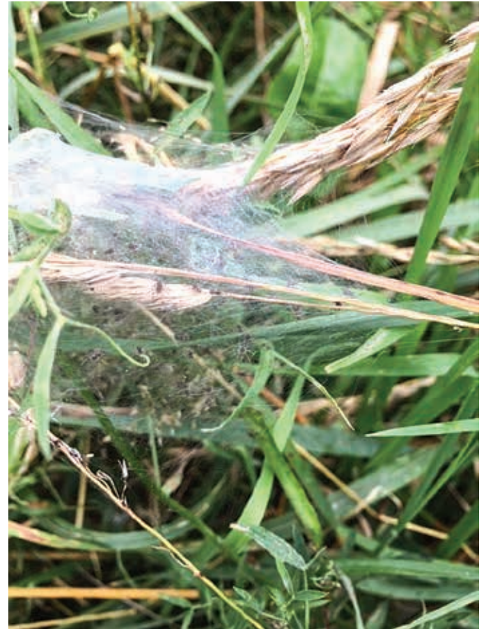
On the web: This intricate construction was spotted at Long Lane Pasture.

Do you get your blackberries from supermarkets? In the summer you can get the tastiest, juiciest and sweetest blackberries in Long Lane Pasture for free (but you can give a small donation). You can also volunteer to help at Long Lane Pasture. Young people can help with jobs like seed collecting, and surveying the wildlife, including in their various ponds. I hope to see lots of you there. So come along and decide for yourself what you think. Find out more at www.longlanepasture.org