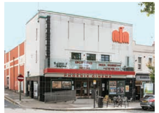
Second screen: The Phoenix is starting to plan

asked to email management@phoenixcinema.co.uk. Autumn attractions The Phoenix has come through the traditionally quiet summer period thanks to audience hits like the music documentary Pavarotti and