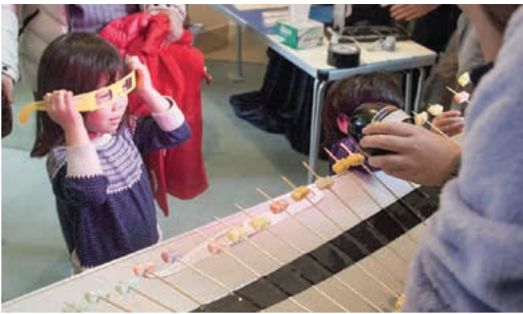
Try it out: Young visitors to last year's Fun Palace find out about a jelly baby wave machine.