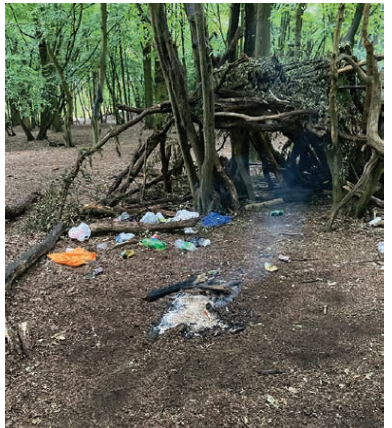
Morning after: Litter and a smoking fire in Coldfall Wood.

By late June Coldfall was very dry so several bright