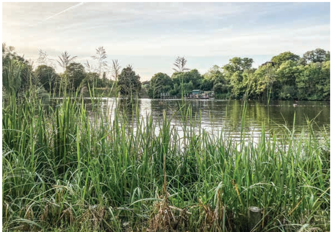
Open water: The Men's Pond on Hampstead Heath now needs to be booked and paid for in advance

Residents can report anti-social behaviour on the 101 police number or online at www.met.police.uk/ro/report . In case of emergency, always dial 999.