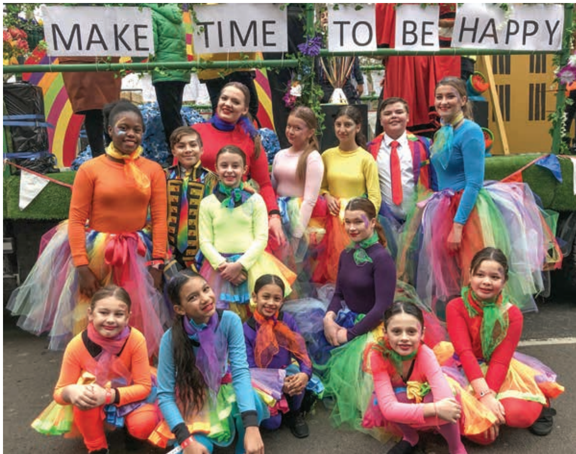
Float on: The Fixation Theatre youngsters alongside their carnival vehicle in central London.

Other strong performers last year were Quentin Tarantino’s Once Upon a Time in Hollywood and repeated showings