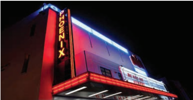
Financial worries: The Phoenix Cinema

The theme of their float was ‘Live Your Best Life’, focusing on the importance of good mental health, and they danced to Pharrell Williams’s hit Happy as they paraded past thousands of spectators along the central London route. Barnet’s float won fifth place overall, earning £6,000 for charity. Fixation offers a range of performing arts classes in East Finchley for young people aged three to 18. Find out more at www.fixationtheatre.com