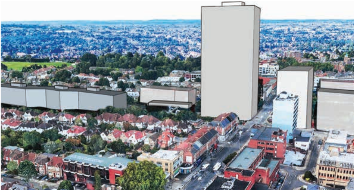
Towering: An artist's impression of how the Finchley Central development could look.