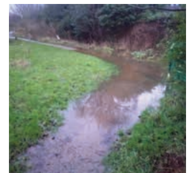
Left and above: Photos of flooding at Long Lane Pasture taken by one of its volunteers.