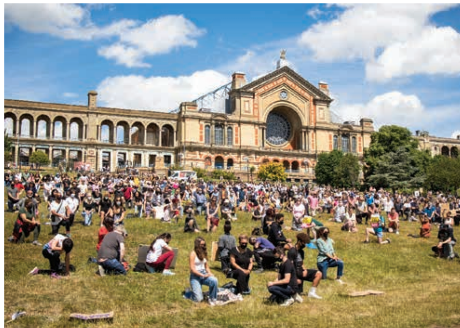
Peaceful protest: Hundreds kneel in solidarity with the Black Lives Matter movement at Alexandra Palace.

There was a powerful and peaceful demonstration at Alexandra Palace on Saturday 13 June when more than 500 knelt in silence for eight minutes and 46 seconds, the same amount of time a Minneapolis police officer knelt on Mr Floyd's neck.