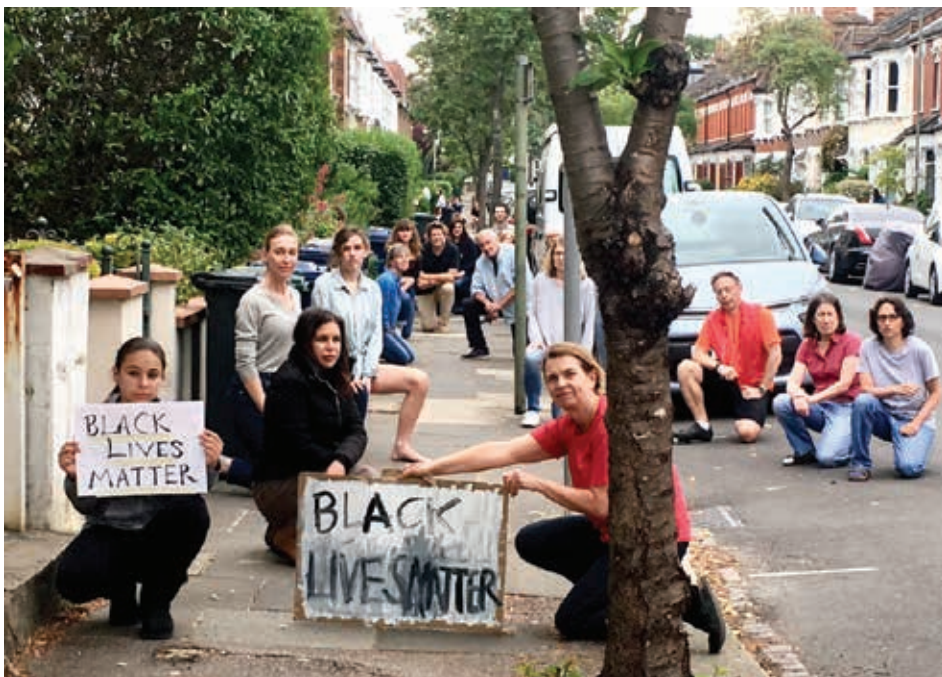
'Strength of feeling: Residents in Bedford Road take the knee to back the Black Lives Matter movement.

People in East Finchley and Muswell Hill came out in their hundreds last month to show their support for the Black Lives Matter movement following the death of George Floyd while being arrested by police in the US.