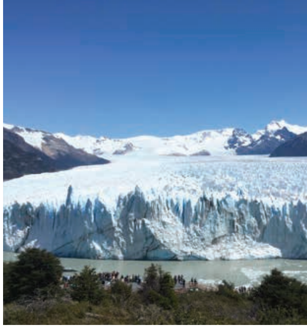
Seen from the road: Malcolm's photos of sunset in the Atacama Desert, Chile, and the Perito Moreno glacier in Argentina

Having reached Ushuaia and the wind-blown tip of South America I headed north into Patagonia which is split between Chile and Argentina. The weather was cold and wet but the landscape was spectacular, particularly the strikingly beautiful Perito Moreno glacier that descends from its ice field into a great lake, a palette of blue and greenish colours and sounding like a shooting range as it fractures.