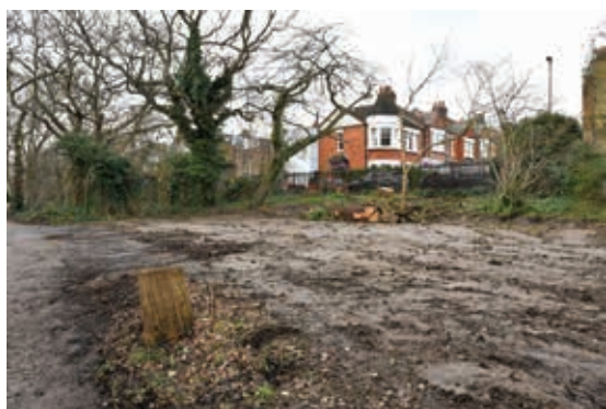
Back to earth: The former pavilion site is now bare soil.

However, during the 1980s it was used less and less and gradually fell into a state of disrepair. As it became more dilapidated concerns grew about its safety and many wondered what could be done with the long-standing building.