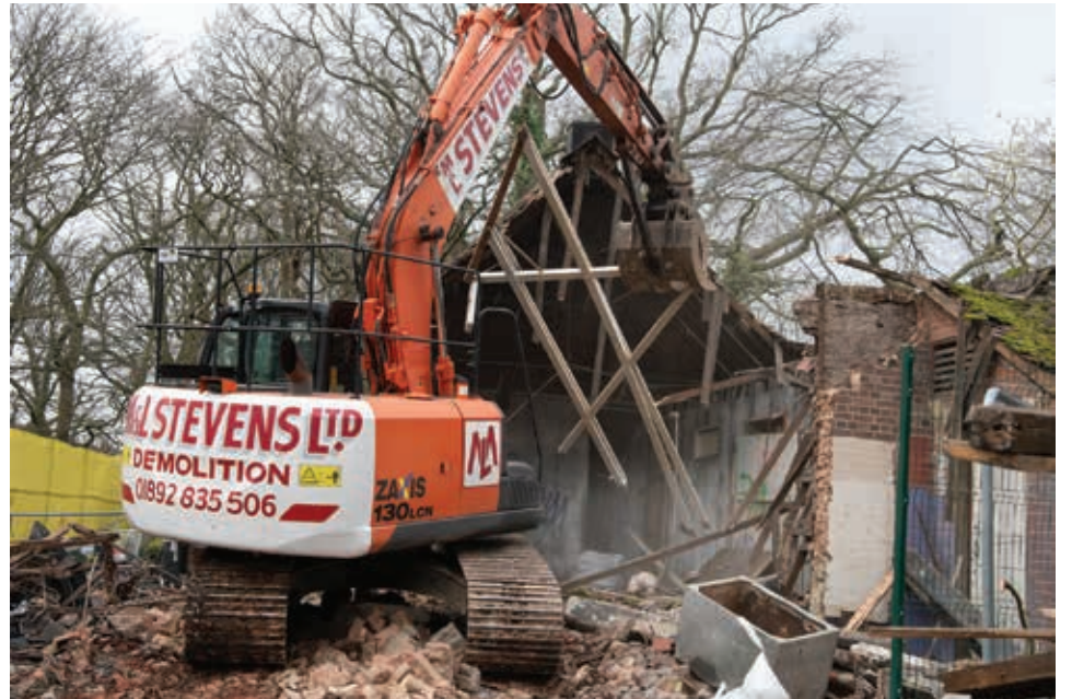
Tomn down: The roof and walls of the pavilion are reduced to piles of brick and timber.