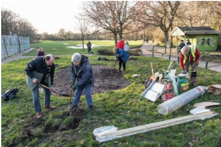
Fruitful expectations: The Friends of Cherry Tree Wood prepare the ground for the new trees.

The next Friends meeting is on Tuesday 21 April at 7.30pm. For more information or to keep in touch with the Friends, email: friendsofcherrytreewood@gmail.com