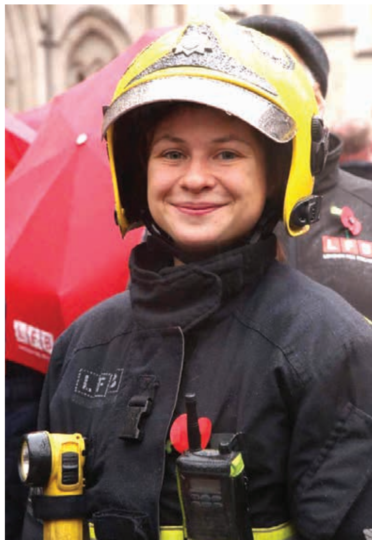
Ready for action: A young fire cadet.

The incident in The Causeway occurred less than six months after a teenage girl was subjected to a serious sexual assault by a group of boys in exactly the same spot and has led to calls from residents for CCTV cameras to be installed.