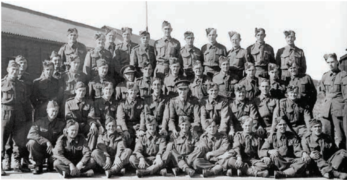
Fighting on the home front: The Simms Home Guard unit 1944

I started at Simms in 1957 as a technical apprentice on £2-16s-4d a week and had 6d for the social club and 1d for the Red Cross deducted. I left Simms in 1965 and went to work for Scholl, the foot people, in east London, for an extra £1 a week. I retired 19 years ago aged 60 as the operations director of Scholl's factory in Derby, where I still live. I can say that Simms training helped me enormously over the years.