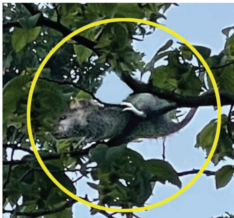
Social climber: A rat, circled, in a tree near the High Road entrance to the wood.