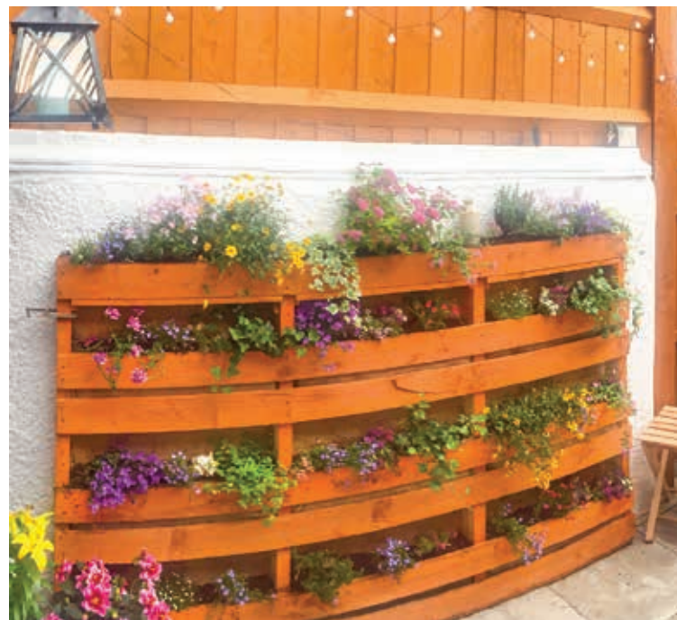
High-rise horticulture: This tiered planter makes the most of the limited space in a courtyard garden.

Do not feel held back if space is limited, a garden can be a tin can with a single seed, simply make the most of what you have. Consider going vertical to maximise