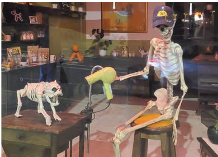
Barking: The Halloween window display at Fetch22 (see letter, below right)