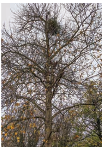
On high: Mistletoe