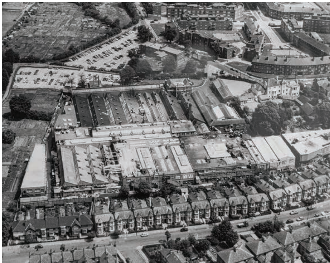
Industrial belt: The Simms car part factory occupied land between Oak Lane, top right, and Long Lane, bottom

An important employer of many local people including this gentleman's father, mother, brother and sister and many of his friends and neighbours, Simms employed East Finchley folk across four shifts, 24 hours a day. On saying our goodbyes he promised to share a selection