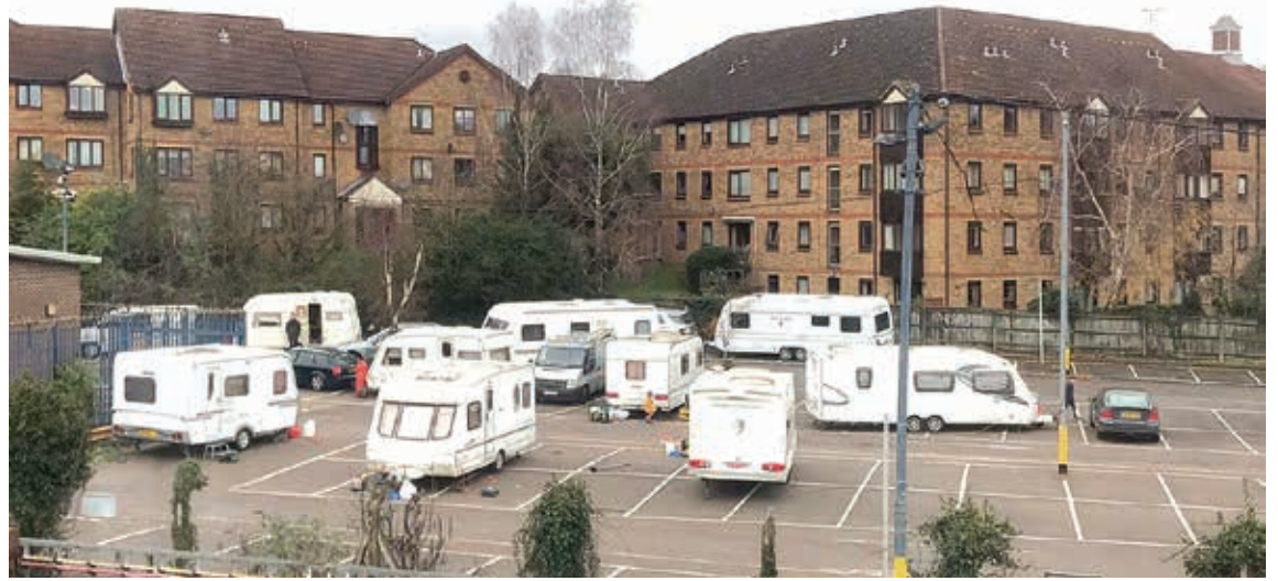
Caravan park: The travellers and their vehicles occupying part of the station car park.