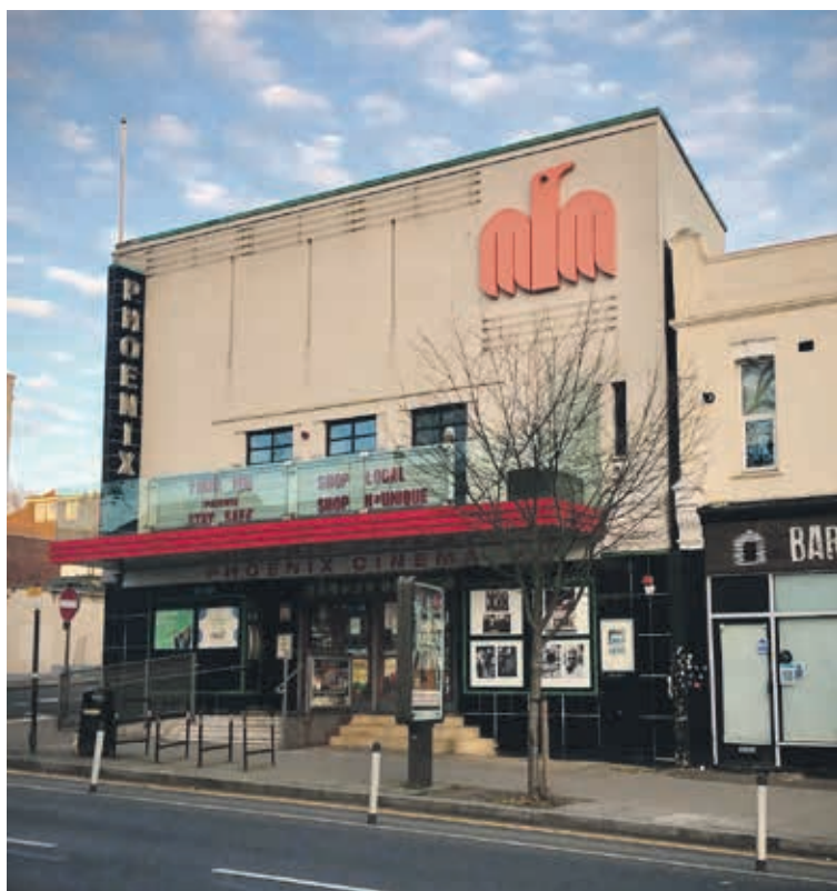
Closed again: The Phoenix Cinema.

The new Covid-safe hygiene rules mean cinema goers are greeted in the foyer with a temperature check and reminded to wear masks. Spaces are marked to keep people two metres apart and food and drink can be pre-ordered from the café to avoid having to queue twice. After a screening, customers leave through a separate exit and the entire auditorium and waiting area is aired and cleaned before the next show.