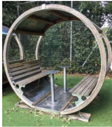
Round table: An interesting place to take a pit stop near Parliament Hill.

Keep going through the park area, veering right at the fork onto Nassington Road. Go left