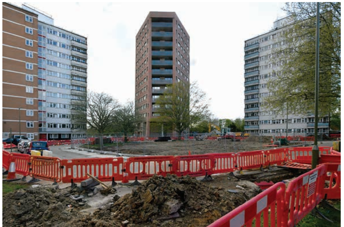
Building site: Above and below, Prospect Ring residents have faced disruption and lack of parking outside their homes for months.

To date the survey has been completed by 92 of a possible 600 households. Pablo aims to achieve a response rate of at least a 50% by the end of June. To make your views known, go to bit.ly/N2roads or do so via the East Finchley Community Facebook group.