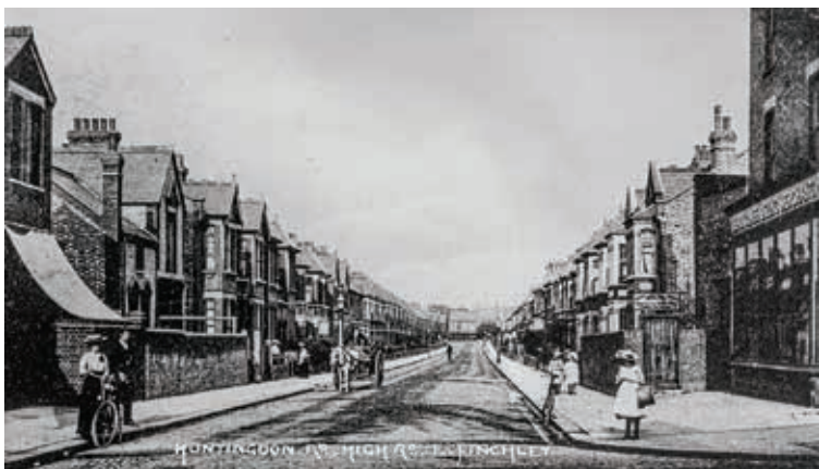
Car-free: Huntingdon Road in a photo from around 1905.

The survey identifies those completing it by their road and house number, with no further details required. The second question on the survey asks: "Regarding the flow of motorised traffic through the county roads, are you in favour of a change in how this is managed or would you prefer it remains as it is today?" giving plenty of scope to maintain the status quo. A series of possible solutions to change traffic management follows, including the installation of speed cameras, speed signs, road humps (not popular so far) and one-way systems.