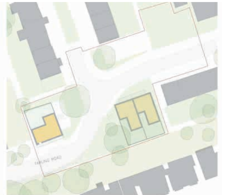
New build: Three three-bedroom homes will be built on green spaces in Tarling Road. Car parking will be provided adjacent and opposite. All diagrams taken from the Newman Francis consultation document available for viewing at: www.givemyview.com/grangeestate