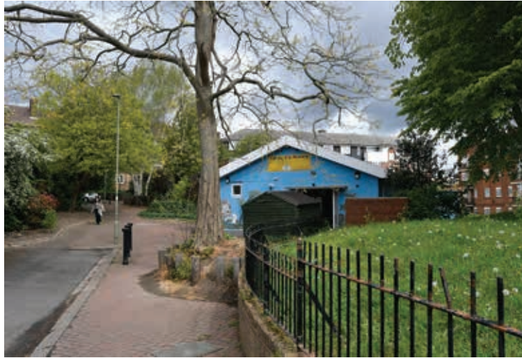
Going: The nursery building on Red Lion Hill will be demolished

At the time of going to press, 676 residents had signed a petition to save the Brownswell Green playing area and prevent the demolition of the homes. Resident Associations have been formed at both these sites to register their green spaces as community assets in order to protect them.