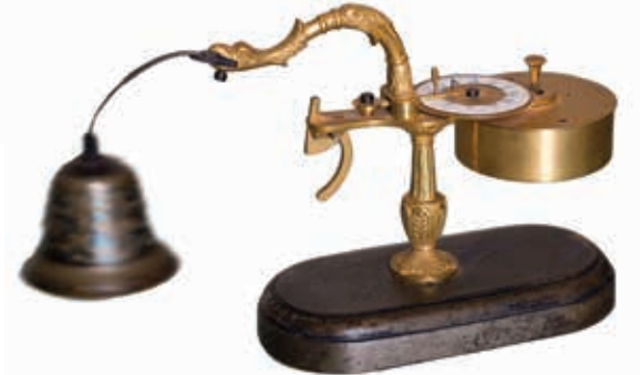
2. Up with the larks