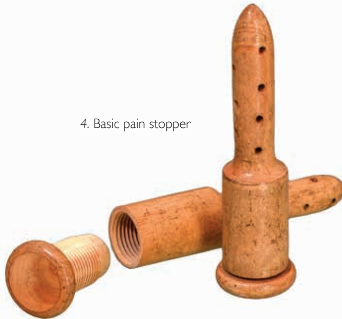
4. Basic pain stopper