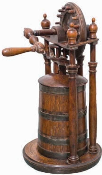
3. Used on the farm