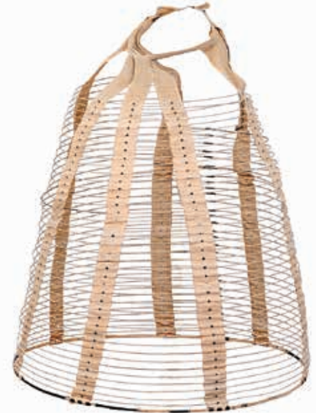
5. Ladies may figure this out