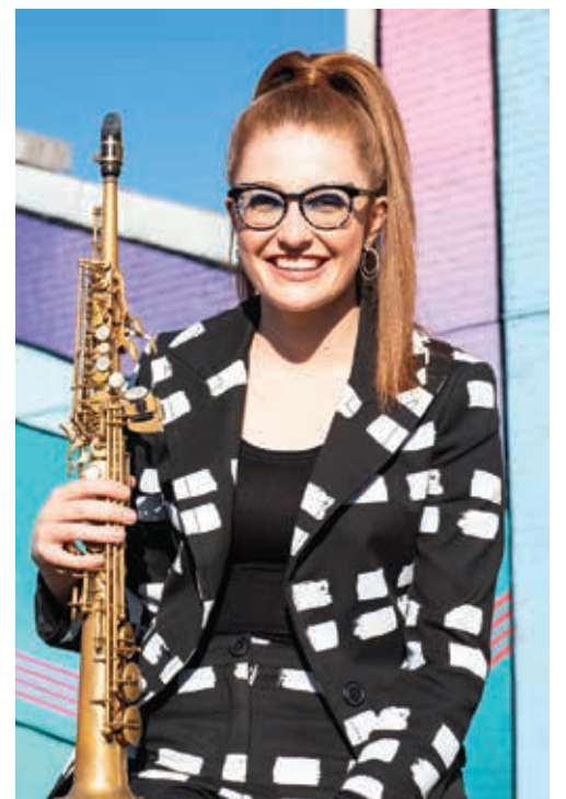
Saxophonist Jess Gillam.