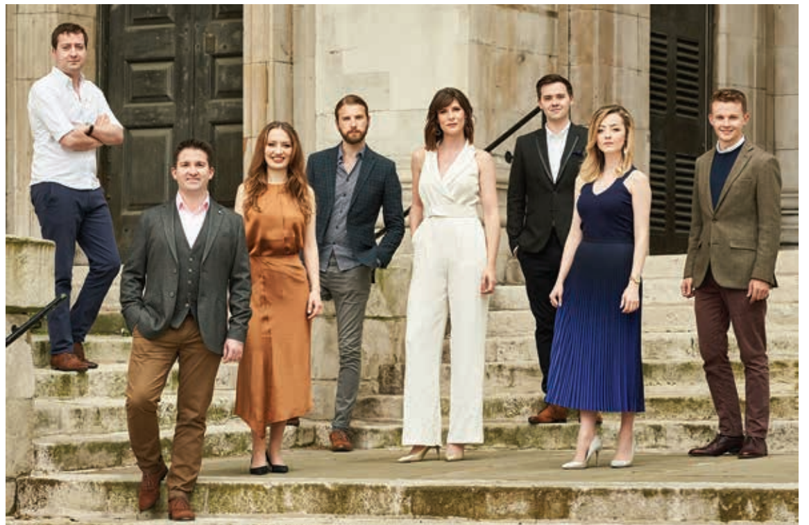
Vocal group Voces8.

Some of those signing the petition posted reasons for giving their support. One wrote: "When I'm coming back from school I'm too scared to come this way and have to go the long way." Another commented: "I