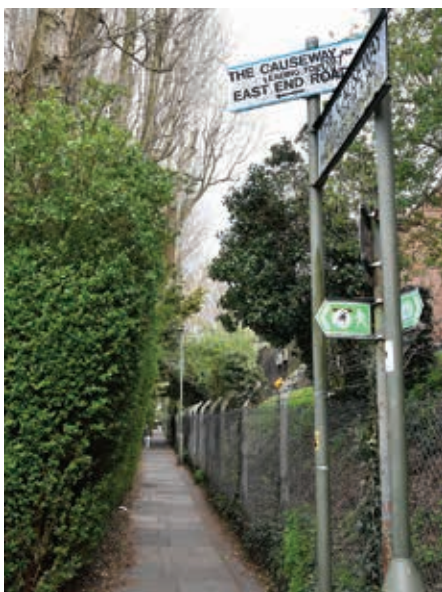
Safety calls: Residents are asking for CCTV on The Causeway

To view and sign the petition, go to: https://you.38degrees.org.uk/p/thecauseway