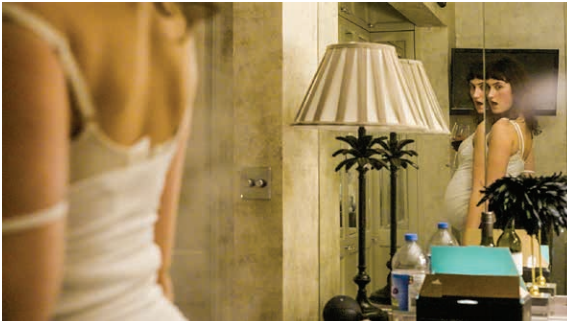
Modern tale: A still from the short film Crowning