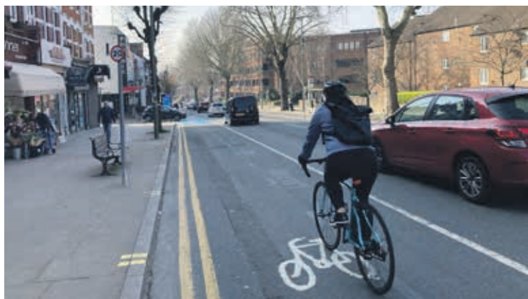
Being removed: The cycle lane heading south towards the station

Cyclist, drivers, traders and all residents are invited to give their views on the changes via the new A1000 Experimental Cycle Route consultation online questionnaire, which closes on 12 August. To complete it, go to www.barnet.gov.uk and find the Consultations page. To request a paper version or for help and further information, phone 020 8359 3281 or email highwayscorrespondence@barnet.gov.uk . Alternatively, you can write to Highways, London Borough of Barnet, 2 Bristol Avenue, Colindale, NW9 4EW.