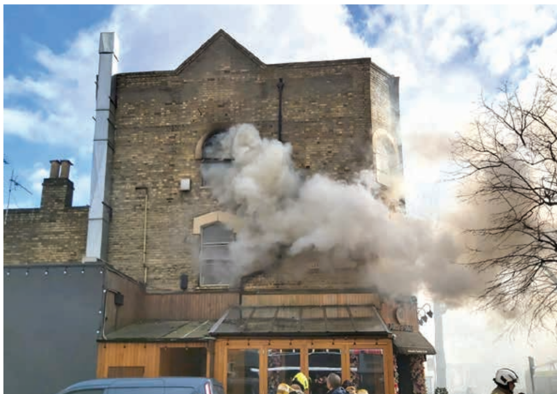
Ablaze: Fire crews in attendance as smoke billows from the second-floor flat.