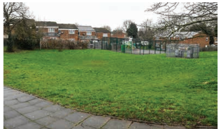
Brownswell green now: Proposed block A would occupy the foreground and block B would take the place of the three homes on the right, beyond the green.

The Archer asked Barnet Homes how much green space was covered over by the first design and how this compares with the revised plans. A spokesperson said that this