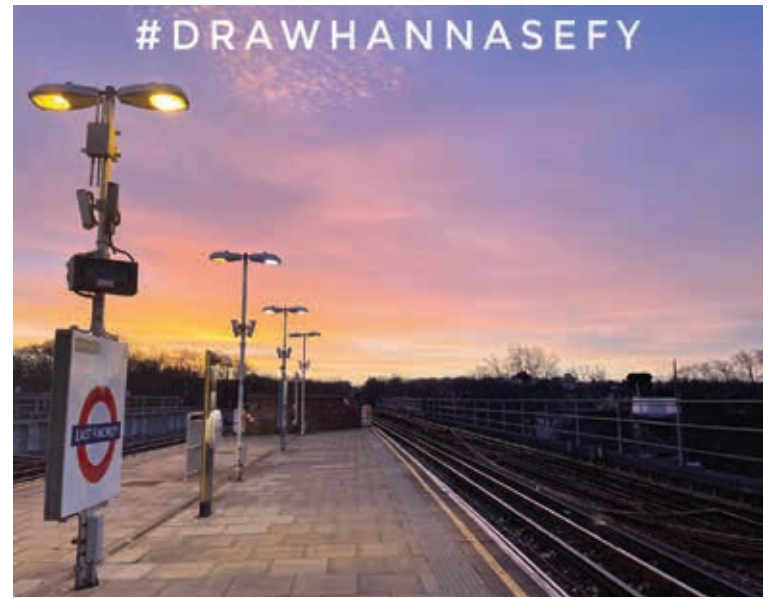
Inspiration: Above, Hanna's original sunrise photo and, below, the painting she created from the scene