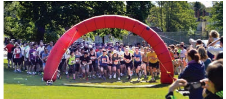
And they're off: The starting line in Cherry Tree Wood

Twelve guided Heritage Walks will also take place during the festival this year. As well as many looking at different fascinating aspects of the Suburb and Hampstead, one will focus on Covent Garden, one on Spitalfields and Whitechapel, and one on Cricklewood and the emerging Brent Cross Town. You can keep an eye on the latest Proms news and find booking details at www.promsatstjudes.org.uk