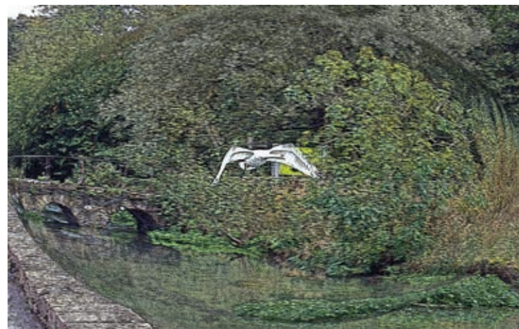
Flight path: Michael's image of a swan coming into land on water

Birds in flight were the subject of an exhibition by local photographer Michael Duke at the Queens Wood Café, off Muswell Hill Road, N10, last month. Flocks of seagulls and pigeons, and a single swan coming in to land, were captured by Michael's lens and then given a dynamic artistic treatment.