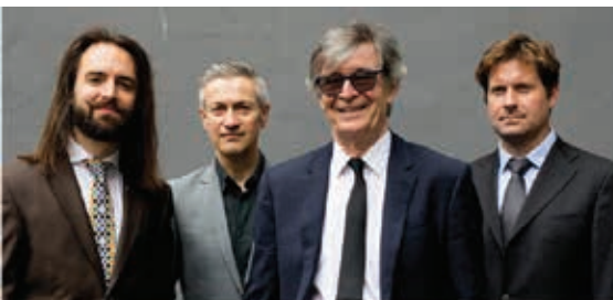
Darius Brubeck Quartet