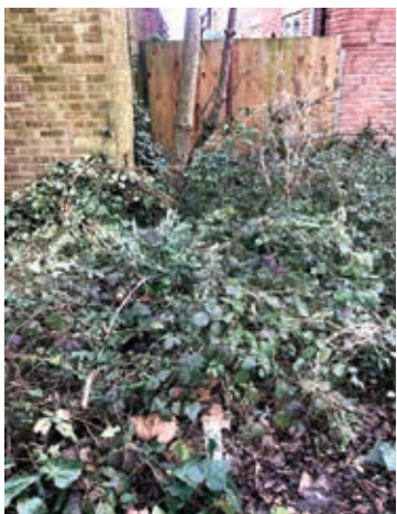
Before and after: One of the overgrown plots at Chapel Court transformed into a tended garden.

With a lot of hard work, they have established several flower beds and cultivated other patches with a variety of vegetables and fruit. These are grown in the ground as well as in containers and raised beds. There is also a lawn which is left partly unmown to encourage wildflowers and to fit in, like the rest of the site, with the East Finchley Pollinator Project.