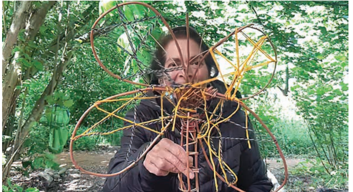
Stick insect: A Forest School member shows off the butterfly-shaped she created from willow sculpture.

The regular Muswell Hill Indoor Car Boot Sale takes place this month on Saturday 27 August from 10am to 1pm at the usual venue of Hornsey Parish Church Hall, on the corner of Cranley Gardens and Park Road, N10 3AH. Admission is 50p and there are refreshments available.