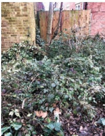
Before and after: One of the overgrown plots at Chapel Court transformed into a tended garden.

With a lot of hard work, they have established several flower beds and cultivated other patches with a variety of vegetables and fruit. These are grown in the ground as well as in containers and raised beds. There is also a lawn which is left partly unmown to encourage wildflowers and to fit in, like the rest of the site, with the East Finchley Pollinator Project.