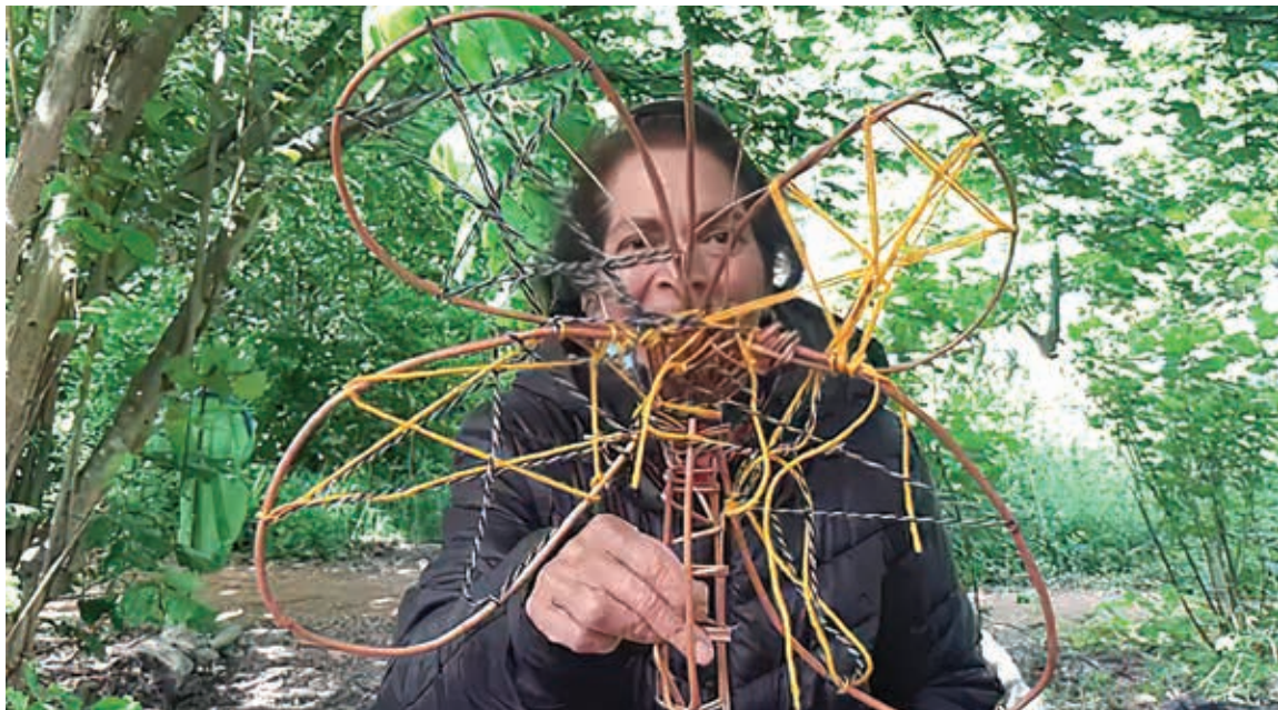
Stick insect: A Forest School member shows off the butterfly-shaped she created from willow sculpture.

The regular Muswell Hill Indoor Car Boot Sale takes place this month on Saturday 27 August from 10am to 1pm at the usual venue of Hornsey Parish Church Hall, on the corner of Cranley Gardens and Park Road, N10 3AH. Admission is 50p and there are refreshments available.