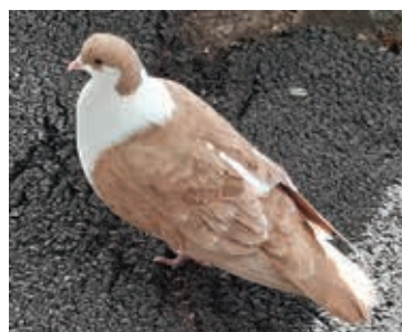
Lovely plumage: Cappuccino?