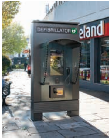
Two sides: The front and back of the new hoarding

Advertising eyesore Dear Editor, Is there anybody out there who isn't appalled by the unwanted advertising excrescence causing a visual and physical obstruction outside Iceland?