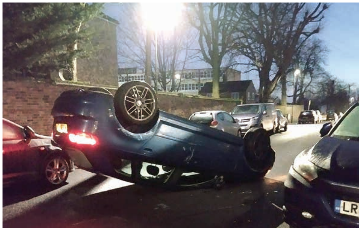
Overtuned: The car lying on its roof in the middle of Hamilton Road.

At the time of going to press, the Friends were awaiting a response from both Barnet Council and Thames Water. Cherry Tree Wood update: p9.