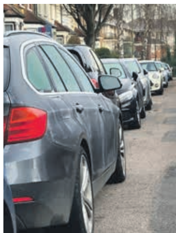
Nose to tail: Is parking a problem in your road?

Controlled parking zones (CPZs) currently exist up to a line between Trinity Avenue, Leslie Road and Hertford Road. Barnet Council is now asking whether residents north of that line want them too. The area to the west of East End Road is not part of the consultation.