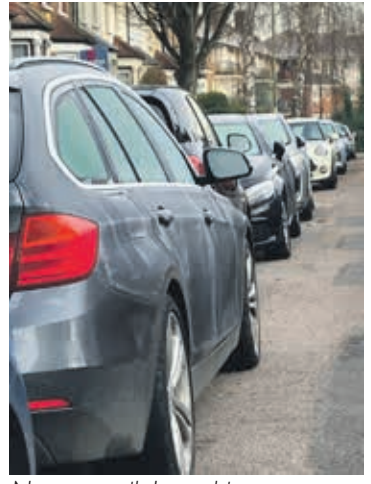
Nose to tail: Is parking a problem in your road?

Controlled parking zones (CPZs) currently exist up to a line between Trinity Avenue, Leslie Road and Hertford Road. Barnet Council is now asking whether residents north of that line want them too. The area to the west of East End Road is not part of the consultation.