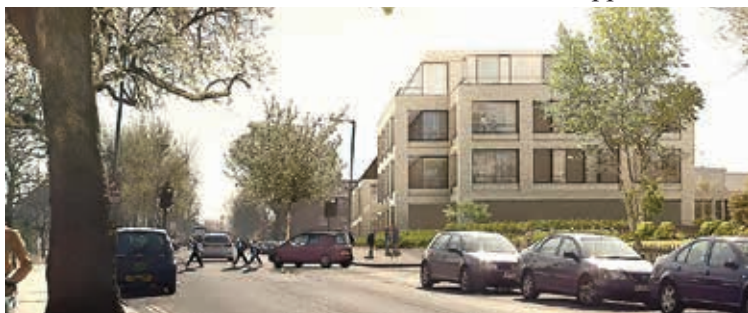
New homes: An artist's impression of the High Road development.

A Barnet Council spokesperson said that although permission to build the homes was valid until November 2022, they couldn't confirm that they will be built because, they said, the owner had not yet met certain conditions, such as the submission and approval of the