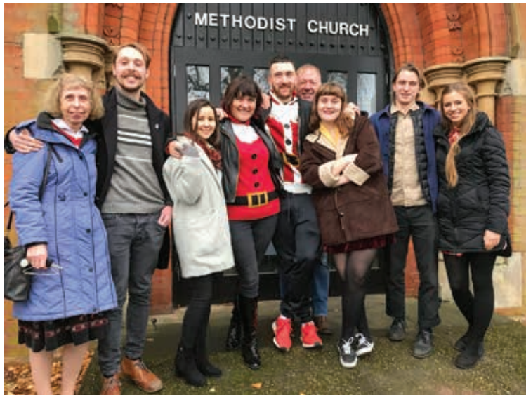
Welcome in: Worshippers are marking 200 years of East Finchley Methodist Church

the meantime, will keep you posted on what's happening through our website: www.eastfinchleymethodist.org.uk