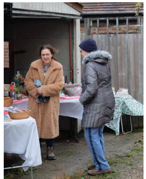
Garage sale: Ceramics and artwork raise funds for the food bank

The food bank will continue to need our local support. As other food banks have closed, they have opened their doors to those beyond the borough of Barnet and, as they say on their website, they work from a position of trust and respect, and welcome all who visit them in need.