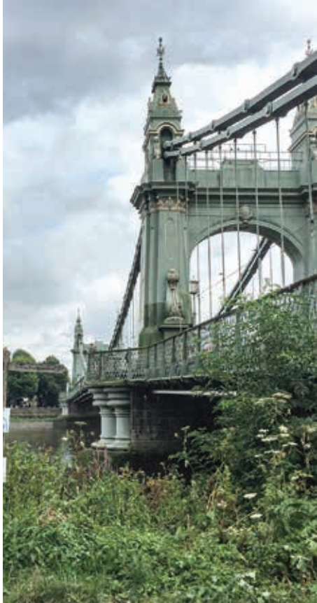
Marvellous sight: Hammersmith Bridge

are allowed on the train outside rush hour; just make sure to give the other passengers enough space.