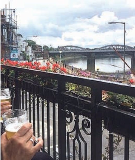
Well-earned break: A riverside drink

If you'd like to spend a bit longer in Barnes, however, admiring the river view, The Waterman's Arms is a local gem where you can sit on the outdoor balconies upstairs while enjoying a delicious pub lunch: the perfect pit stop!