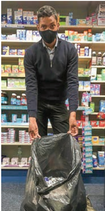
Drop-off point: Staff at Oakdale Pharmacy are ready to take your used tablet blister packs

Already a large number of things, including stationery, foil, wood and carpet bits, can be dropped off at Amy's; now the incredible manager and staff