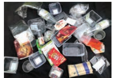
Week's worth: A friend's pile

It seems that there is a limit to what the individual can achieve. We can do our bit and persuade others but we need the backing of government to enforce more sustainable packaging for our food and other essentials. We need to make a loud noise and protest in all the ways that we can.