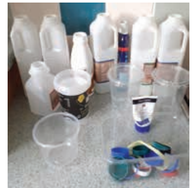
Frugal: A neighbour's plastics

This proved to be rather embarrassing, as the photos reveal. My excuse for having so much was that my brother-in-law came to stay and, not liking my vegetarian food or my cooking, went out to buy