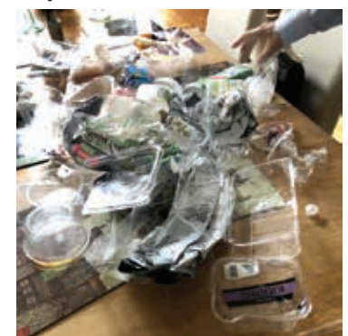
More than expected: Maxine's haul

In normal circumstances, I take my own bag and buy fruit and vegetables locally and only need a plastic bag for a very few items that may get squashed. But I can afford to buy from a green grocer. When I go into a supermarket I can see that the same items in plastic punnets or in plastic bags are much cheaper.