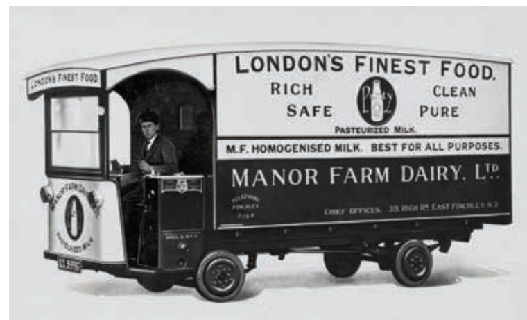
Modernisation: After carts came the electric milk float, also emphasising the benefits of Manor Farm Dairy's pasteurised milk. Note its designated maximum speed of 12mph.