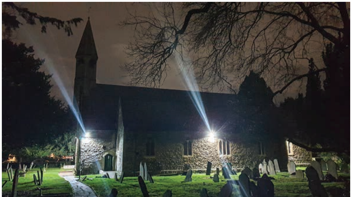
Shots in the dark: These images taken by photography enthusiast Matt Pielas show, from top to bottom, the community green space and the homes of Strawberry Vale behind, the churchyard of Holy Trinity in Church Lane, a foggy East End Road and the Pumphandle Path, off Taring Road