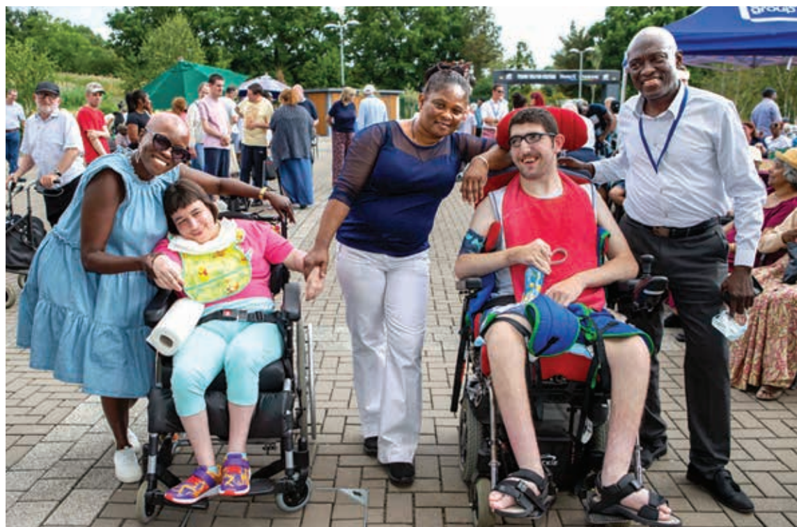
Party time: Guests and carers came together at the Your Choice Barnet centre in Colindale to mark the service's 10th birthday