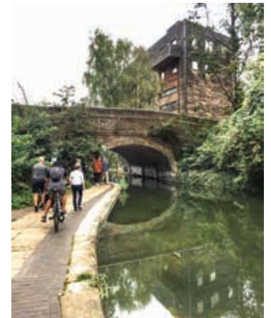
Waterside: Cycle along the canal towpath through Hackney

ney Wick Overground). This is an especially cool area for a little pitstop, with plenty of street art & murals to admire all around.