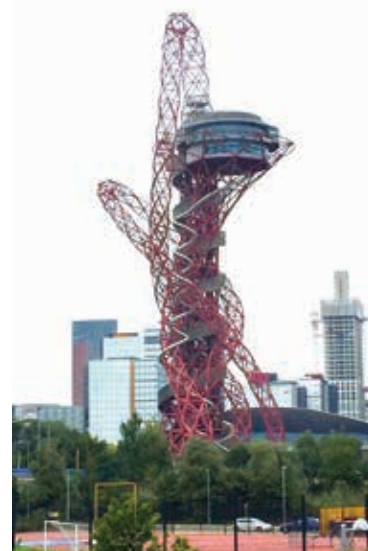
Olympic landmark: The ArcelorMittal Orbit

To get home, you can just retrace the way you came, or alternatively jump on the overground at Hackney Wick. Leave at Highbury and Islington, cycle up Holloway Road and take the third right turning into Drayton Park. You'll see the train station on your left before Arsenal Stadium and this will take you back to Ally Pally.