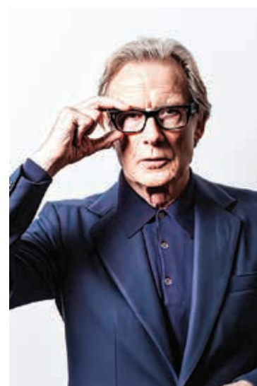
In conversation: Bill Nighy

Proceeds from the event on Friday 28 April will go to the Friends of Market Place who are working to transform the neglected Market Place Playground in East Finchley into a