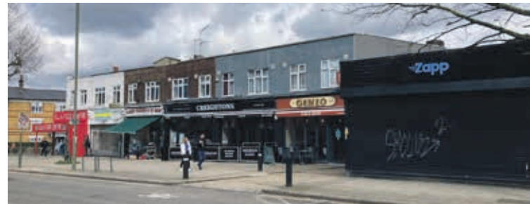
New store: Tesco is moving into the former Zapp premises, right.

Until now the centres of East Finchley and Muswell Hill have been a black hole for Tesco Express stores. It has its larger supermarkets in Finchley Central and Colney Hatch of course but its nearest small stores are in Highgate and North Finchley.