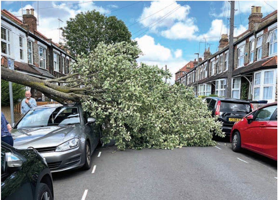
Road block: The mature tree lies across a parked car and completely obstructs traffic in Leopold Road after being felled by strong winds.