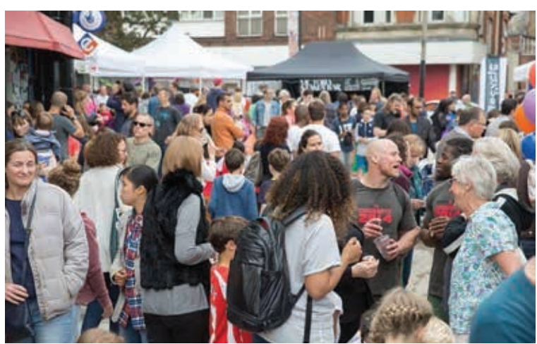
Crowd-puller: Last year's street festival in Muswell Hill attracted hundreds of people to Fortis Green Road.

Copy deadlines - September: 11 August, October: 15 September November: 13 October