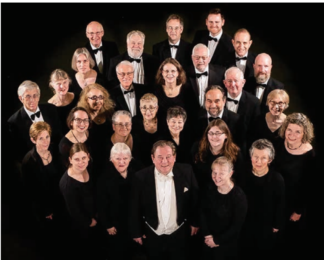
Gather round: Finchley Chamber Choir are performing a concert of Bach and Byrd.