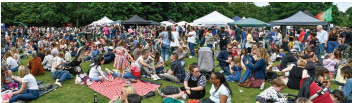
Packed park: The 2022 festival crowd with craft and food stalls in Cherry Tree Wood.

The team needs dozens of volunteers on the day. If you can spare an hour to steward or sell raffle tickets, please email volunteers@eastfinchleyfestival.org or sign up at www.eastfinchleyfestival.org/volunteer