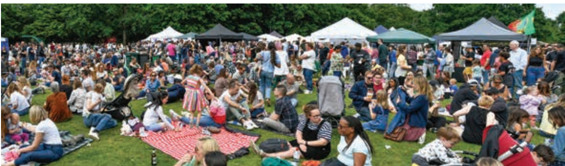
Packed park: The 2022 festival crowd with craft and food stalls in Cherry Tree Wood.

The team needs dozens of volunteers on the day. If you can spare an hour to steward or sell raffle tickets, please email volunteers@eastfinchleyfestival.org or sign up at www.eastfinchleyfestival.org/volunteer