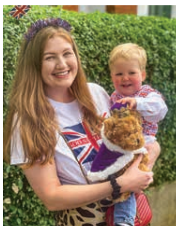
Crowned: A right royal teddy bear

Milly, the very organised member of our team, WhatSapped all the neighbours, gave them the date, asked them to move their cars on the morning of the party and to bring food and drink. Someone offered to put up bunting, someone else organised some music and that was it.