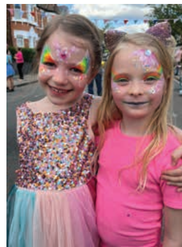
Made up: Face-painted friends

saw someone in the street whom I had not known before and I greeted her by name. Success! I wonder what will be our excuse for our next street party?