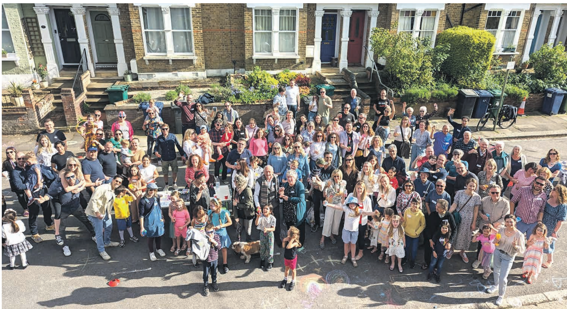
This is us: Residents of Hertford Road gathered for this wonderful group photo at their Coronation street party.