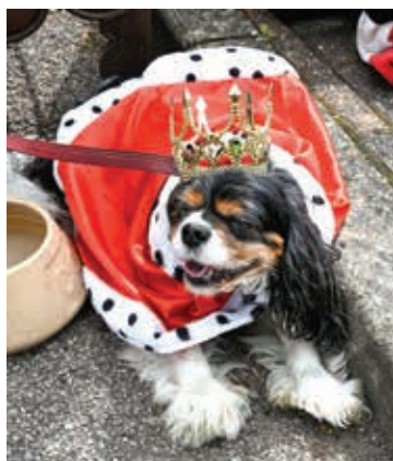
Woof: King Charles (Spaniel)

Came the Sunday after the Coronation, the sun shone, the cars were moved, the tables