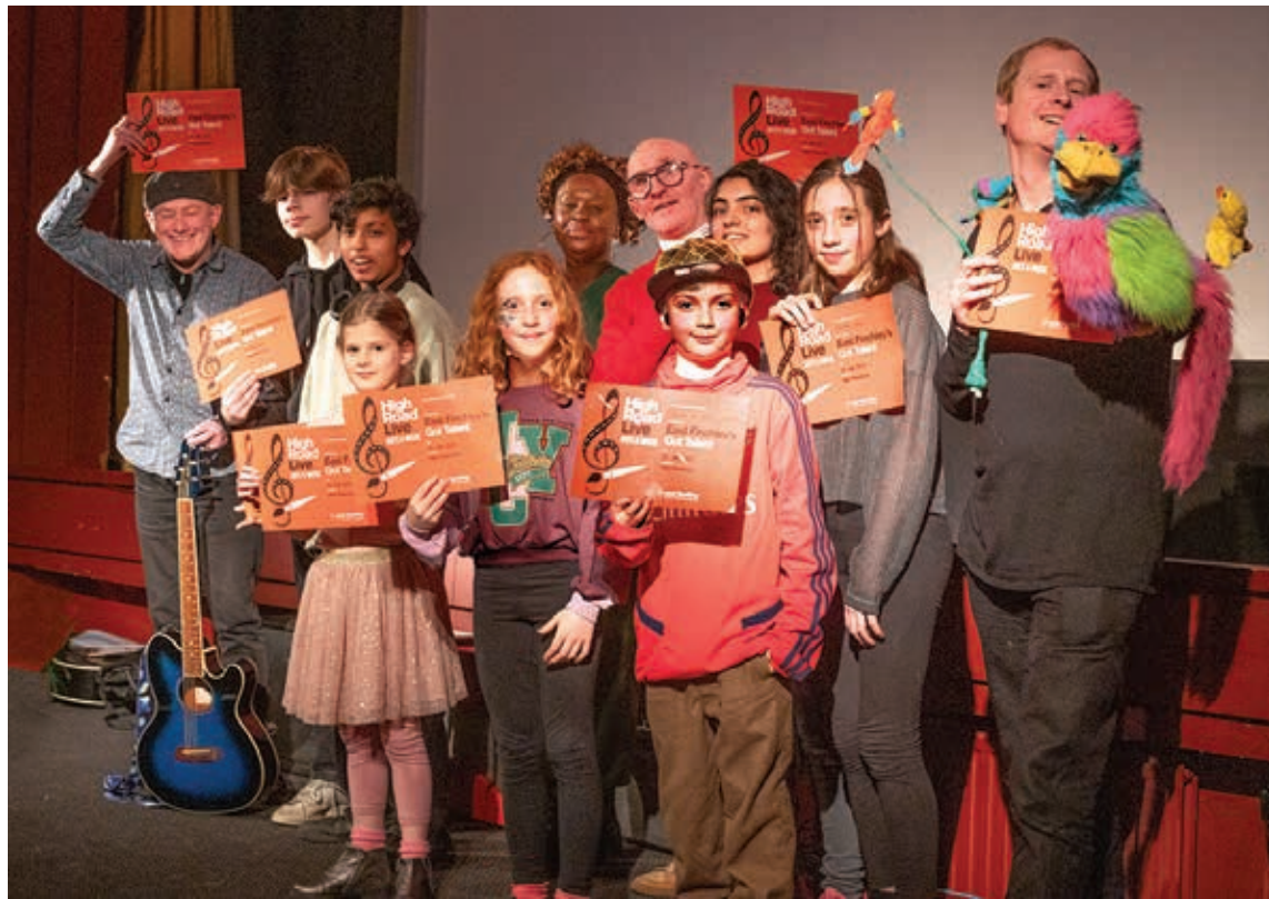
Top of the bill: The line-up of artists who performed at the High Road Live event in the Phoenix.

A community newspaper for East Finchley run entirely by volunteers.